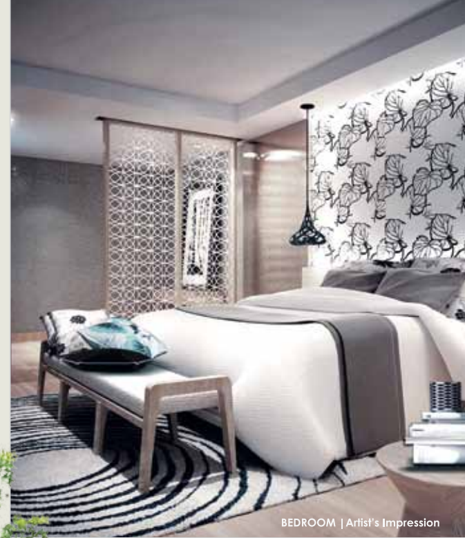
BEDROOM | Artist's Impression