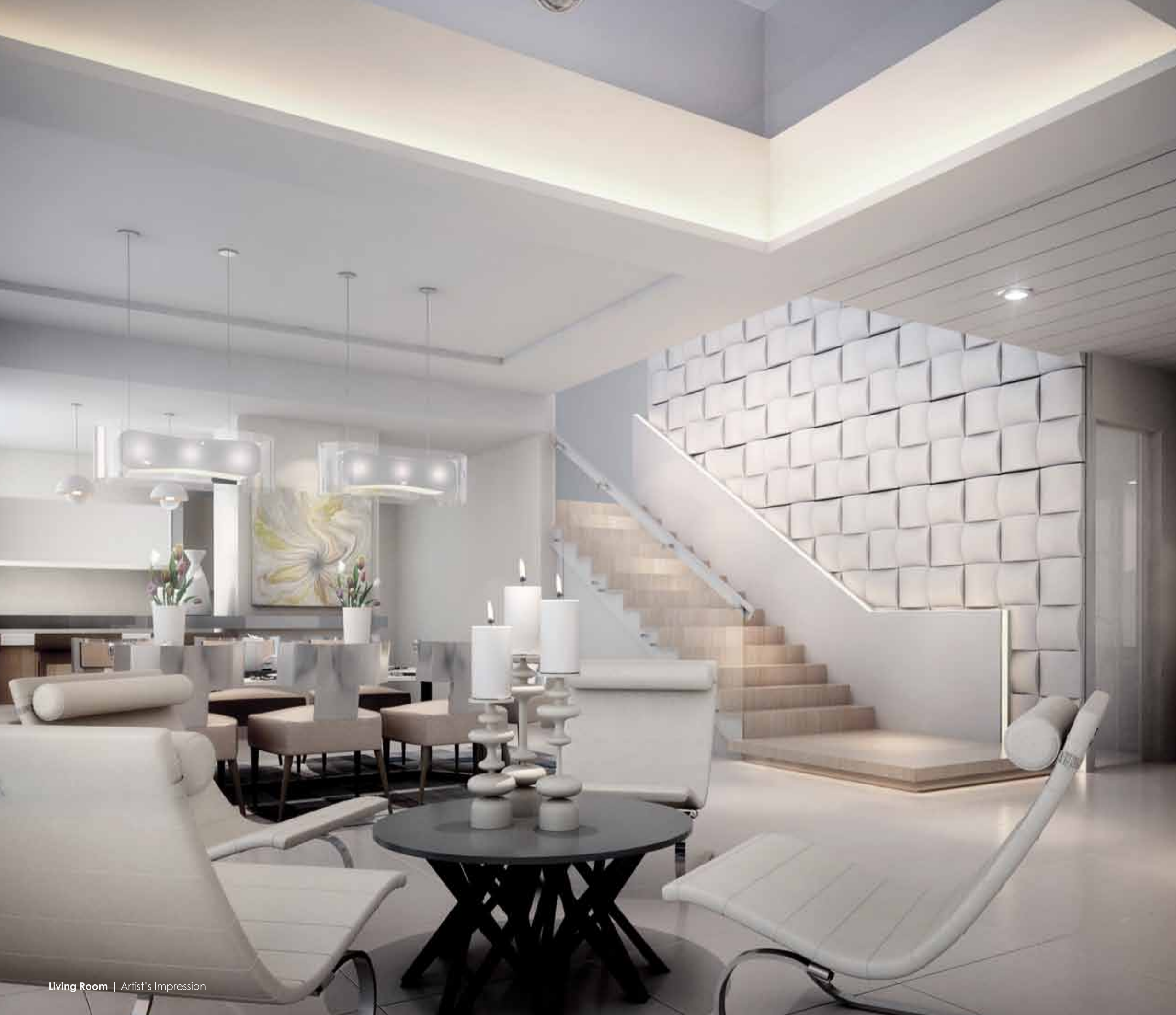
Living Room | Artist's Impression